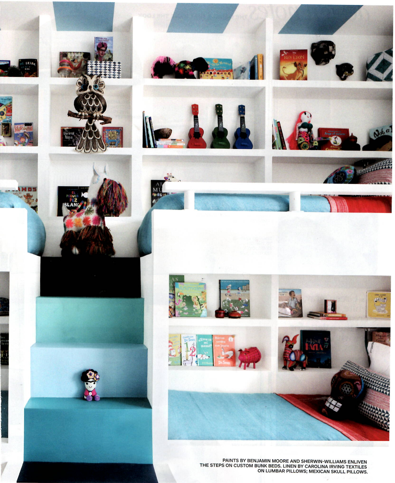
PAINTS BY BENJAMIN MOORE AND SHERWIN-WILLIAMS ENLIVEN THE STEPS ON CUSTOM BUNK BEDS. LINEN BY CAROLINA IRVING TEXTILES ON LUMBAR PILLOWS; MEXICAN SKULL PILLOWS.