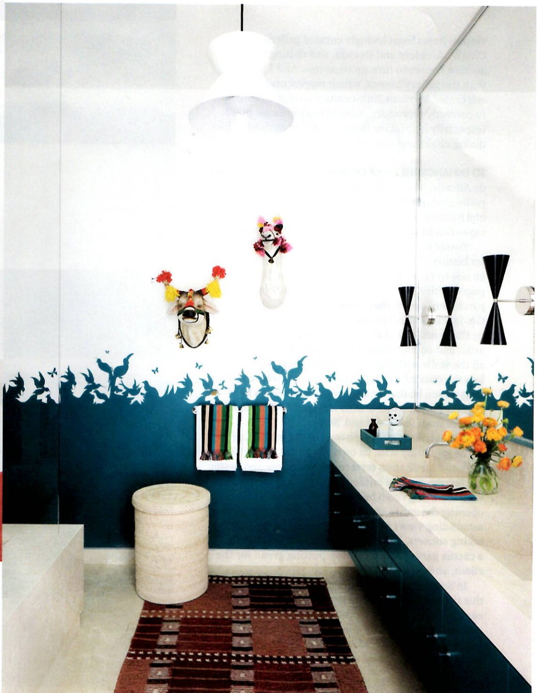
RIGHT IN A GUEST BATH, BENJAMIN MOORE'S TEAL OCEAN ADDS A POP OF COLOR TO CABINETS AND A MURAL BY MEDINA. REJUVENATION PENDANT; VINTAGE AFGHAN RUG.