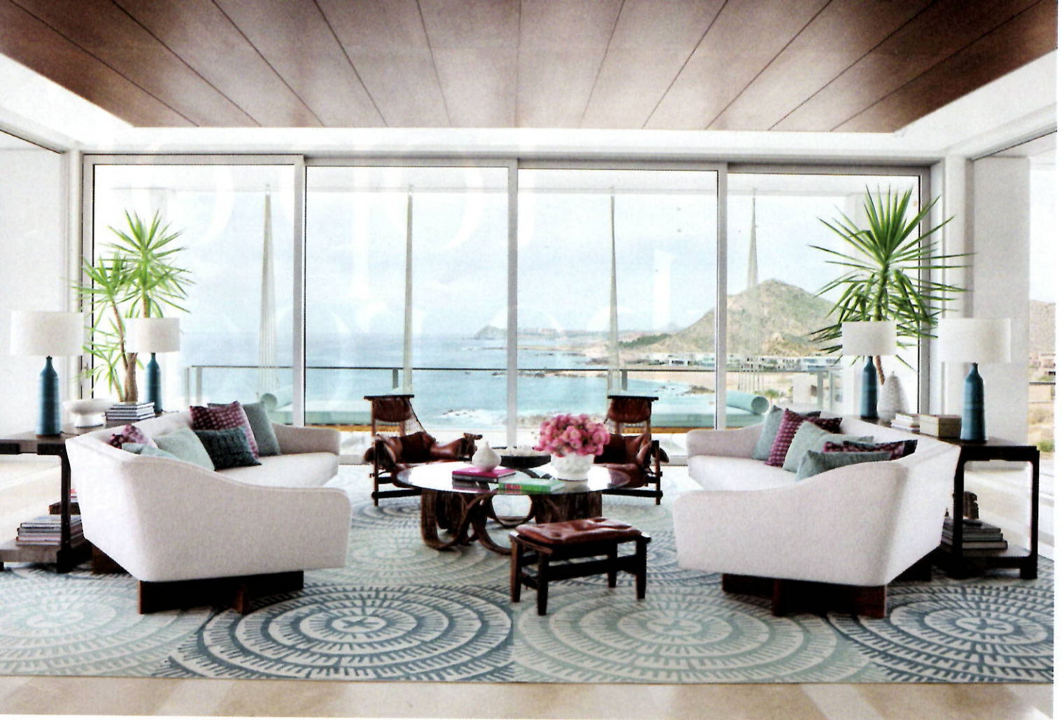
ABOVE A KERRY JOYCE PERFORMANCE FABRIC COVERS CUSTOM SOFAS IN THE LIVING ROOM. VINTAGE JEAN GILLON ARMCHAIRS. RIGHT AN APPARATUS LIGHT FIXTURE HANGS OVER THE CUSTOM KITCHEN ISLAND WITH DORNBRACHT FITTINGS.