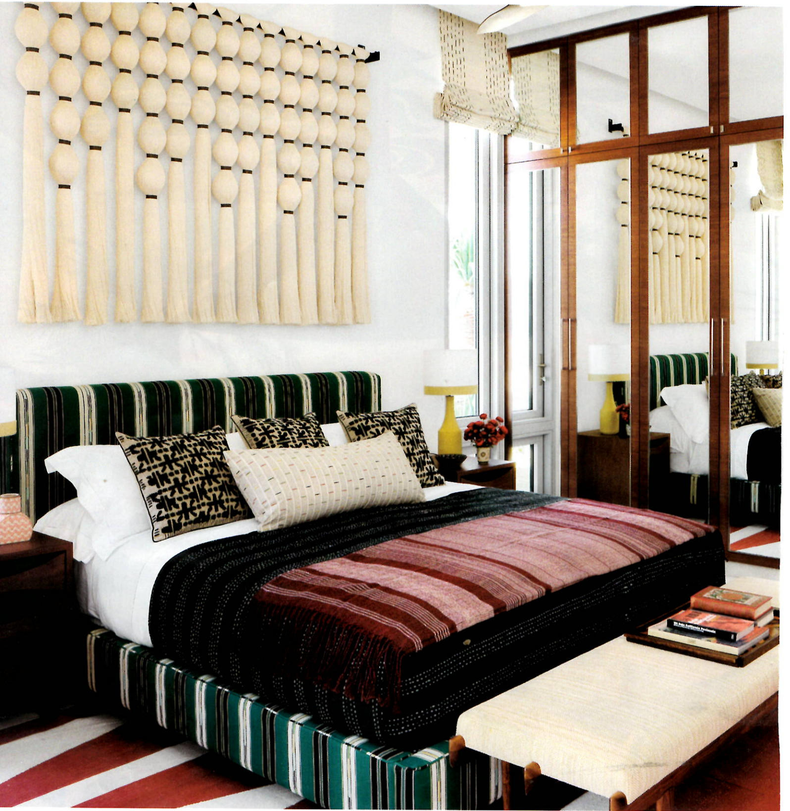
IN A GUEST BEDROOM, A PIERRE FREY COTTON STRIPE COVERS THE BED. DANA JOHN BENCH; LAMPS FROM LAWSON-FENNING ON BULLARD-DESIGNED SIDE TABLES; CUSTOM RUG.