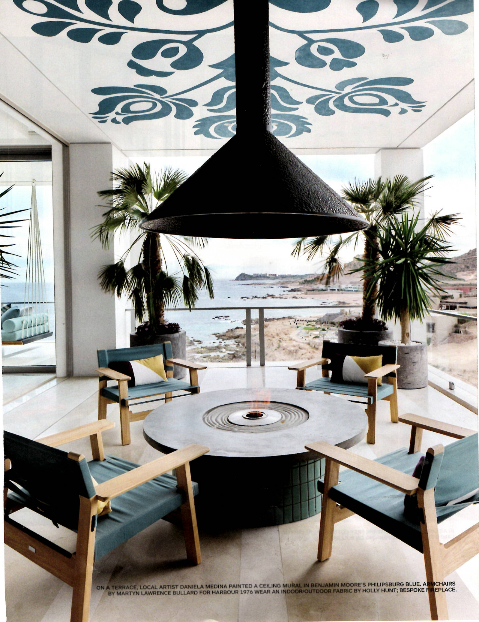
ON A TERRACE, LOCAL ARTIST DANIELA MEDINA PAINTED A CEILING MURAL IN BENJAMIN MOORE'S PHILIPSBURG BLUE. ARMCHAIRS BY MARTYN LAWRENCE BULLARD FOR HARBOUR 1976 WEAR AN INDOOR/OUTDOOR FABRIC BY HOLLY HUNT; BESPOKE FIREPLACE.