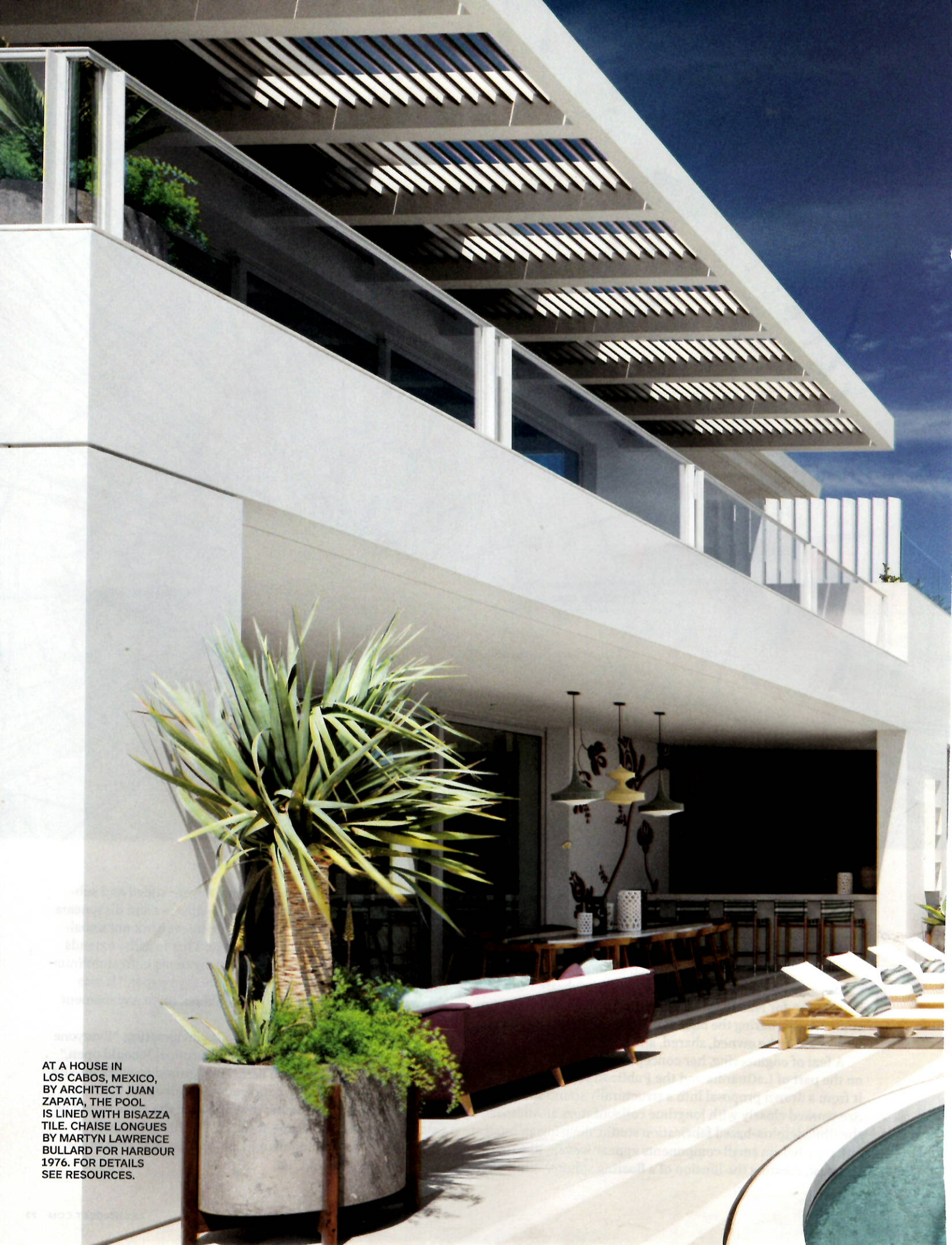
AT A HOUSE IN LOS CABOS, MEXICO, BY ARCHITECT JUAN ZAPATA, THE POOL IS LINED WITH BISAZZA TILE. CHAISE LONGUES BY MARTYN LAWRENCE BULLARD FOR HARBOUR 1976. FOR DETAILS SEE RESOURCES.