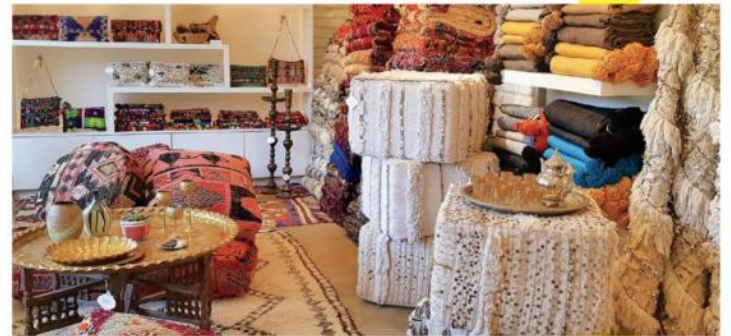
Souk Modern, a striking boutique inside The Shops at Thirteen Forty Five, sells vintage and new Moroccan decor items.

To learn about more events happening in the desert before summer, visit diablomag.com .