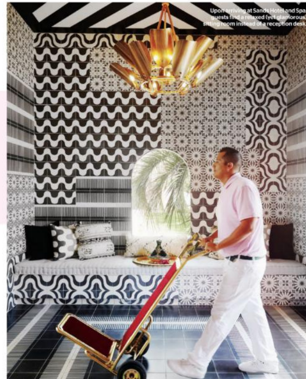
Upon arriving at Sands Hotel and Spa, guests find a relaxed (yet glamorous) sitting room instead of a reception desk.

(Tower visited, and cooked with, his onetime protégé at a special event at the Sands last fall.) The "grilled yogurt naan" (pillowy, yogurt-infused flatbread) that arrives with a meze platter takes two days to make, and it's out of this world even without the delicious dips and spreads. Indeed, many of chef Niederkorn's signature creations are masterfully prepared and burst with layers of flavor. The delicately spiced lamb tagine is melt-in-your-mouth tender. Supremely fresh day-boat catches are flown in straight from Hawaii.