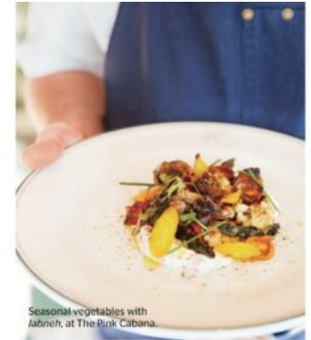
Seasonal vegetables with labneh, at The Pink Cabana.